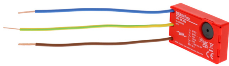
Figure without obligation