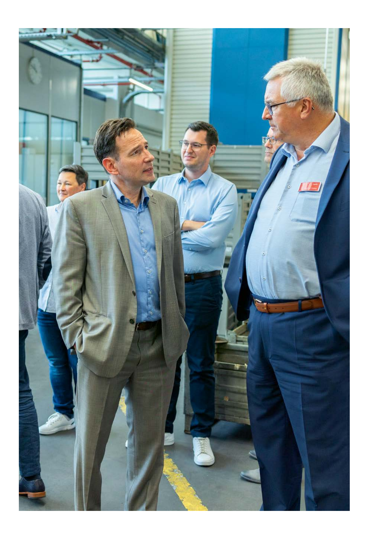
During the factory tour, there are exchanges between all levels of the hierarchy.